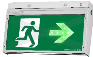
Dynamic LEDs Sequencing Arrow